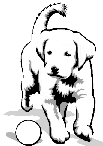
Hundur þarf að sofa _____